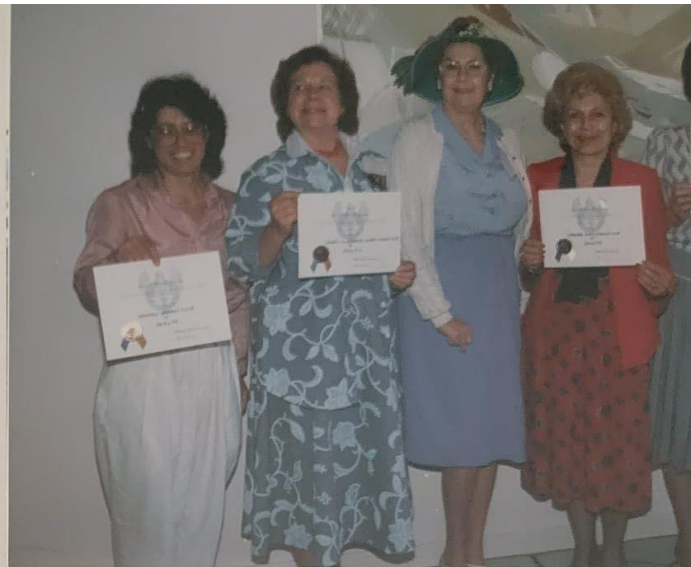
DISTRICT CONVENTION AND AWARDS